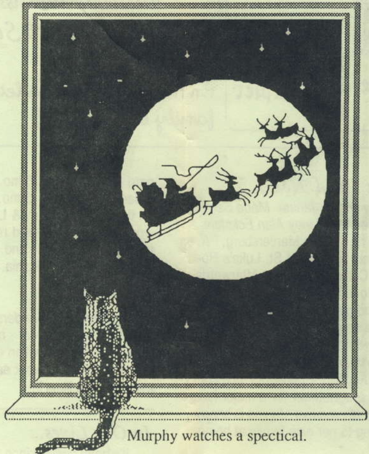
Murphy watches a spectacle.

Murphy was an accident. We babysat him for a friend, but he liked us so well, he stayed. We all like him too. He's very mellow and reminds you of Garfield . He and Sugar get along great. You should see them play together - they actually roll around with each other!